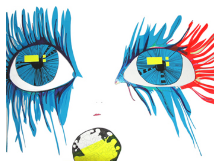
Illustration 64a Oaklands Grove London W12 0JB United Kingdom