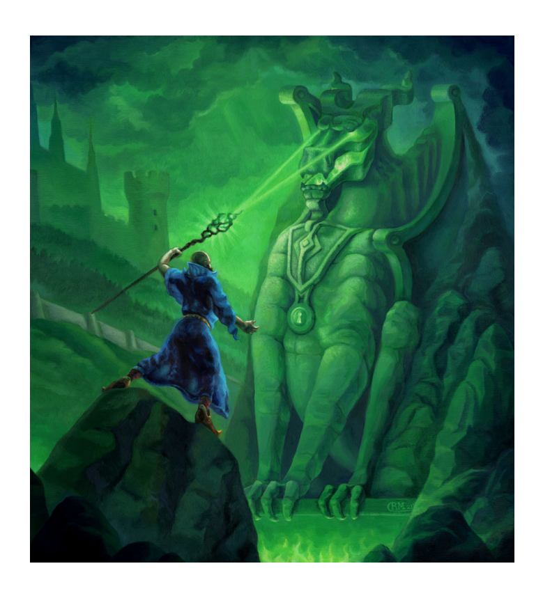
Illustration United States