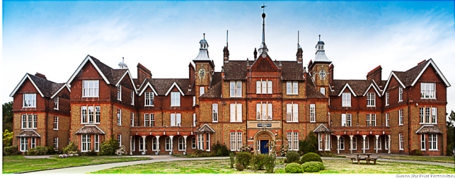
PARKWOOD HALL SCHOOL 2010

View the full portfolio at http://www.thecreativefinder.com/simonjayprice