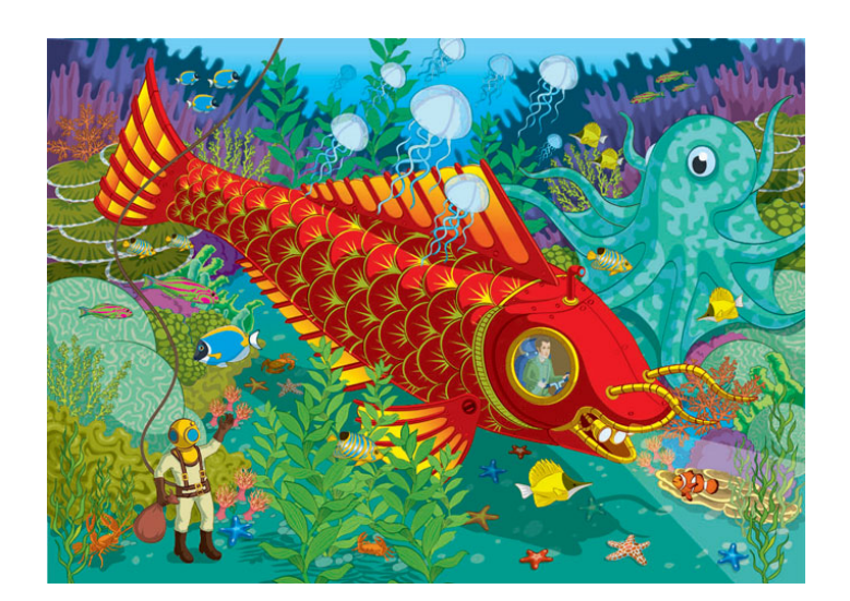
Illustration London United Kingdom