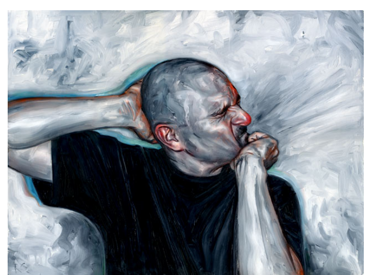
Illustration 50 Erbach Crescent Baden, Ontario Canada N3A 2L3 Canada