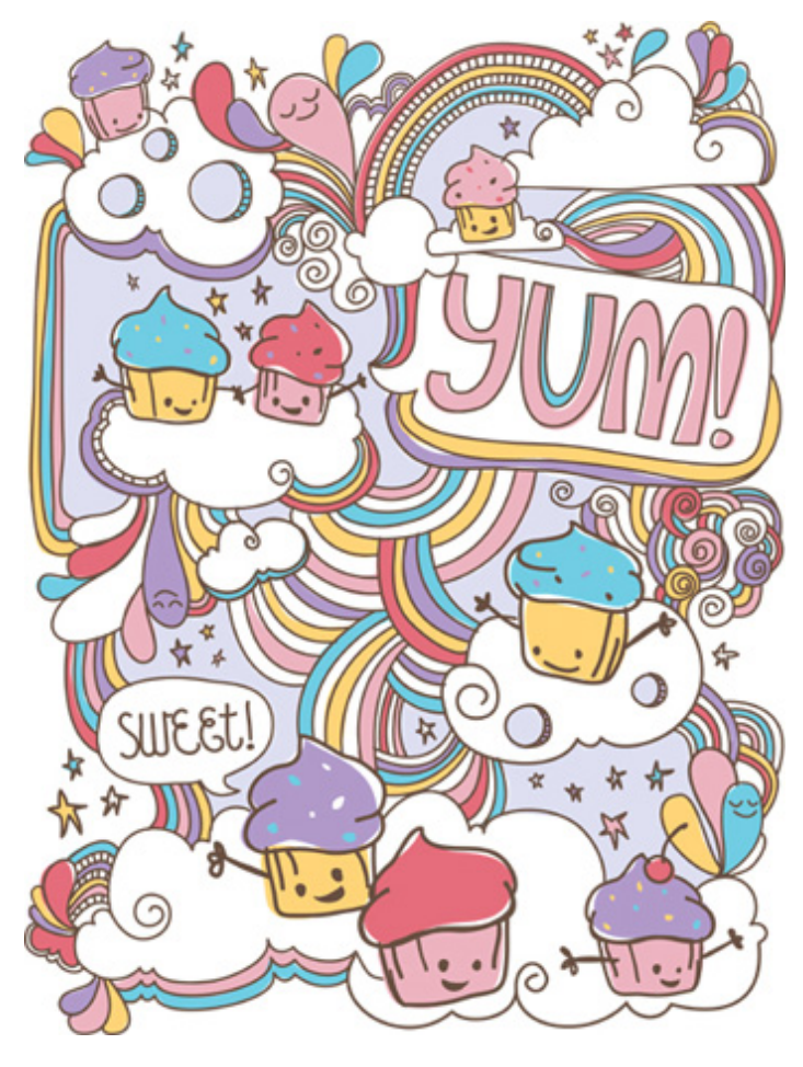
Illustration 4707 Oxford St. Lynchburg VA 24502 USA United States