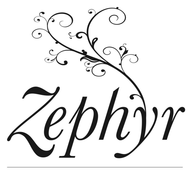
• V I N E Y A R D S •