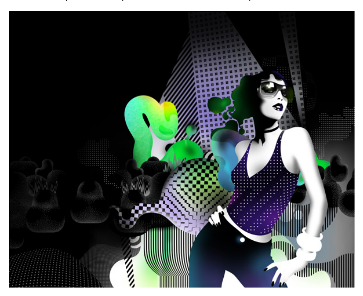
Illustration 38-10, Place du Commerce Suite 611 Verdun, Quebec H3E 1T8 Canada Spain