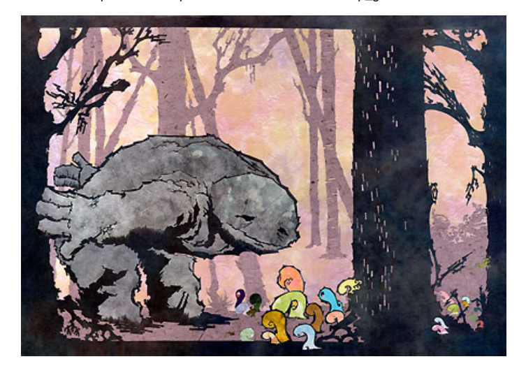
Illustration B-207 Tamagawa heights 1-28-1 Denenchofu Ota-ku, Tokyo Japan 145-0071 Japan