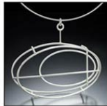
Oval Neckpiece sterling silver pendant 3" h x 4" w x 1.75" d, neckwire available in 16" or 18"

A further examination of the work in line... these pieces are forged steel and are inspired by architectural iron work. Many of the pieces incorporate 18 carat gold. In this work, I am interested in the combination of very precious, traditional jewelry materials with materials that would not normally be associated with jewelry in our culture.