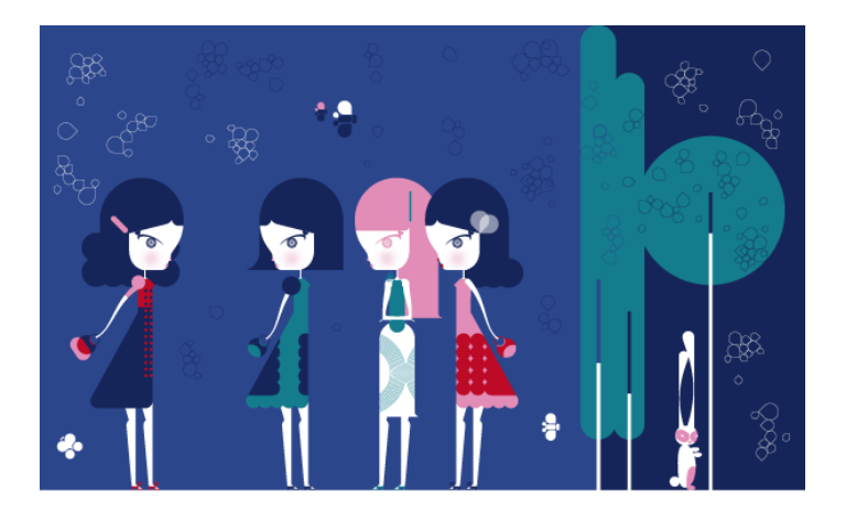
Illustration Barcelona Spain