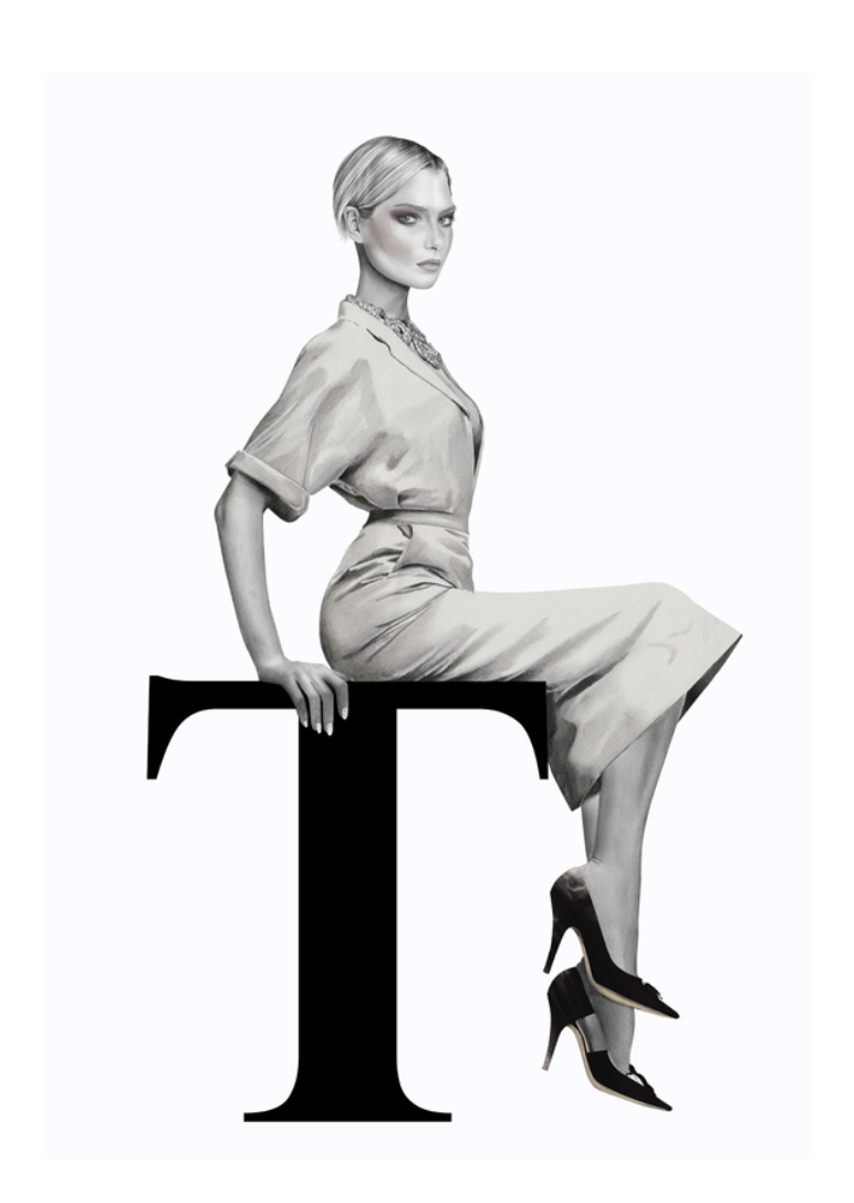
Illustration Tokyo Japan