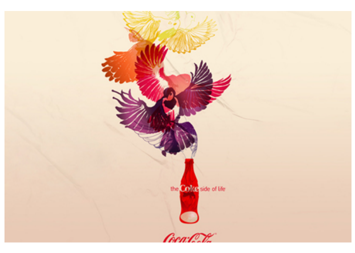
Illustration 18 Richardson St, Apt 2 Brooklyn, NY 11211 United States