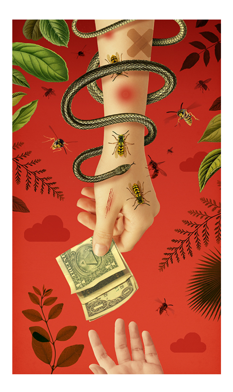
Illustration United States