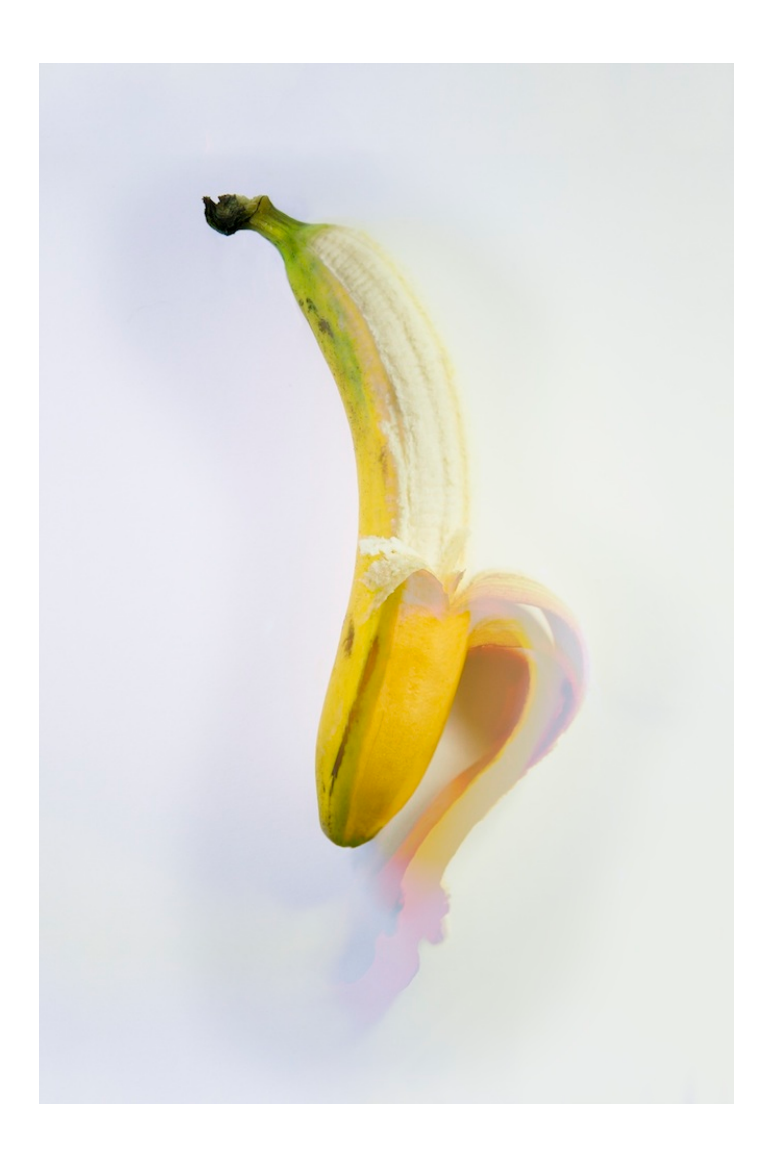
Illustration United Kingdom