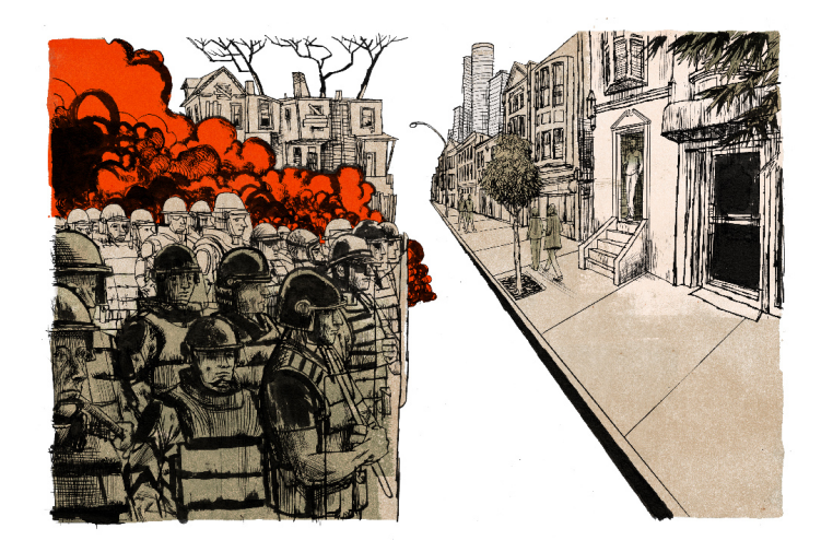
Illustration United States