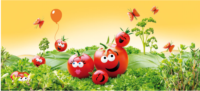
Chopped tomatoes can label

View the full portfolio at http://www.thecreativefinder.com/mathewhall