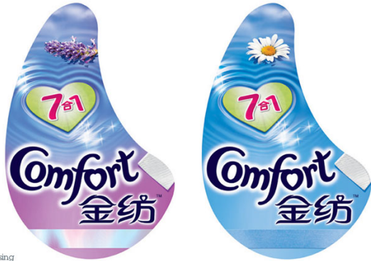
Comfort Concept visualising for Comfort fabric softener

View the full portfolio at http://www.thecreativefinder.com/mathewhall