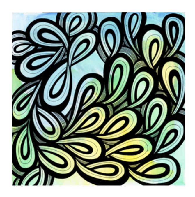
Illustration 535 E. 44th Street Savannah, GA United States