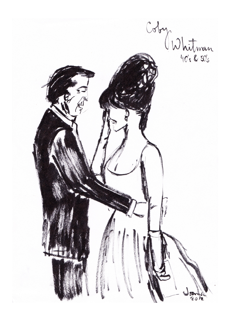
Illustration United Kingdom