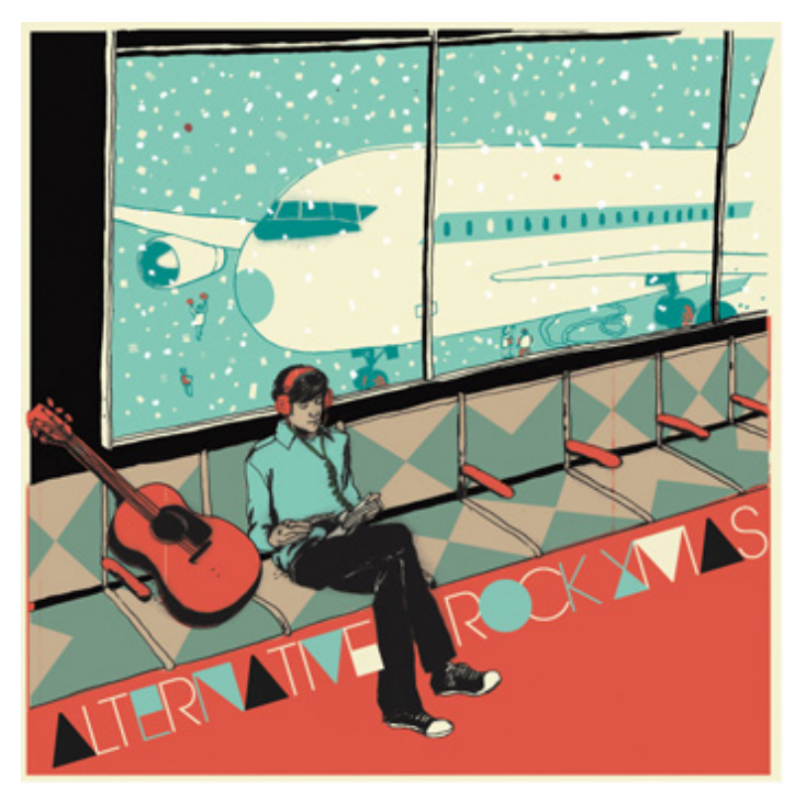
Illustration BOUTIQUE (US) Louisa St. Pierre 58 West 40th Street New York, NY 10018 United States