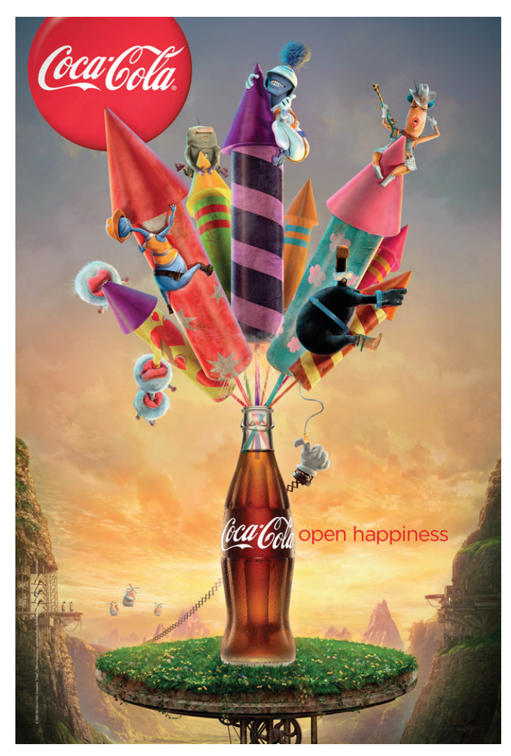
Illustration United States