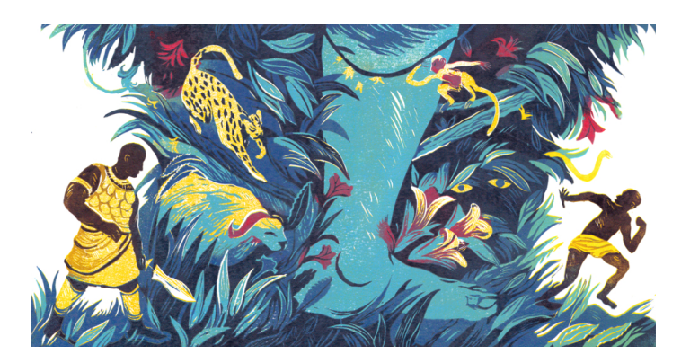
Illustration United Kingdom