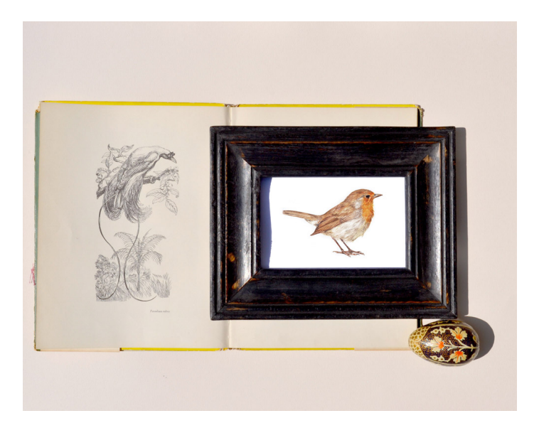
Illustration United Kingdom