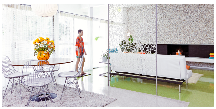
BLAST FROM THE PAST

Please kindly get in touch for portfolio works.