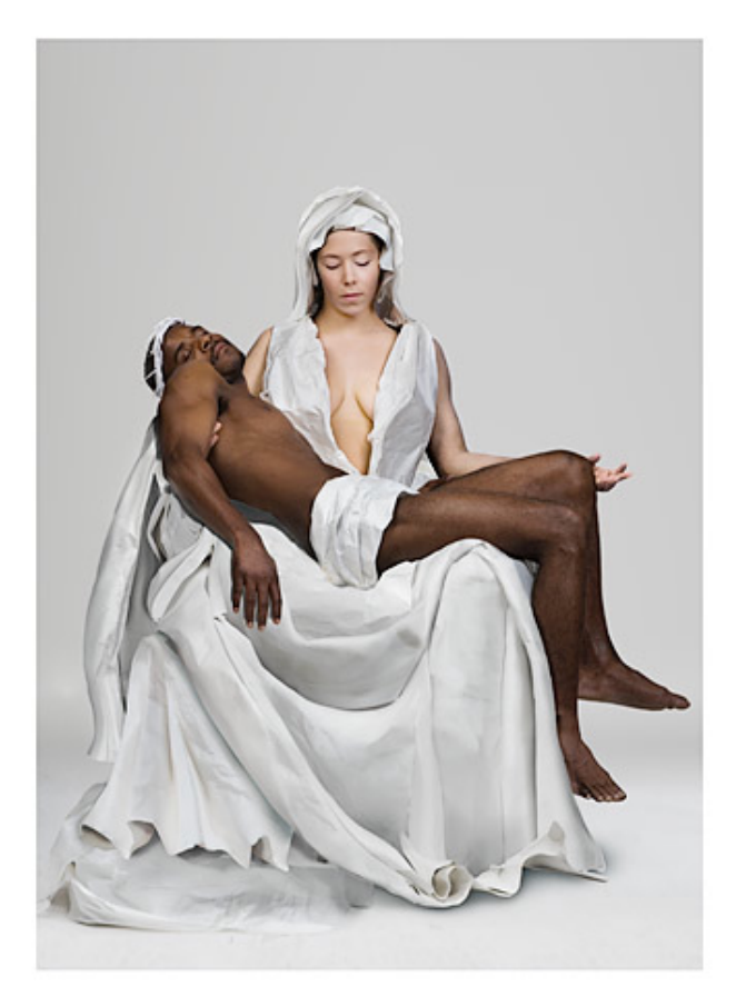
IT'S THE UNISOURCE PAPER SHOW LAS VEGAS WORLD MARKET CENTER - APRIL 19, 2007