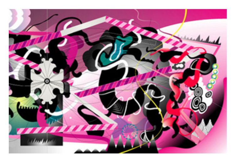
Illustration New York, USA United States