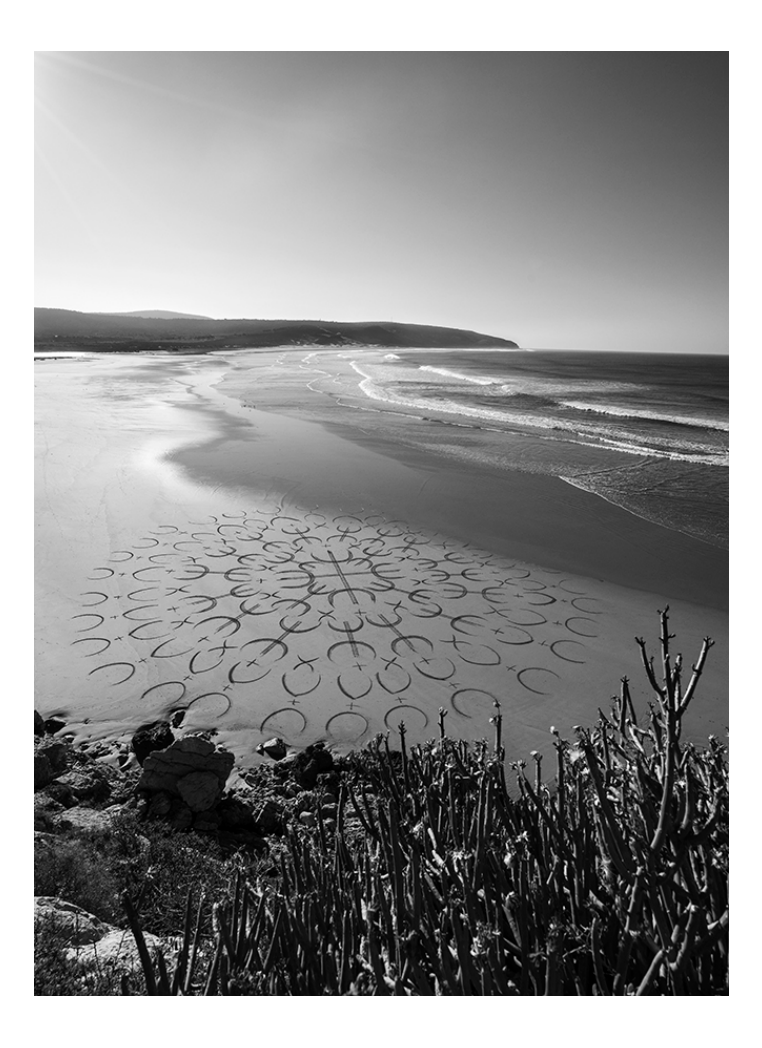
Please kindly get in touch for portfolio works.