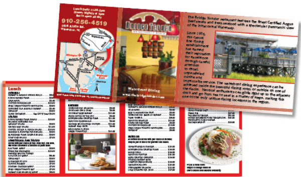
City Select/Virginia Welcome Pocket menus - Art direction and design

View the full portfolio at http://www.thecreativefinder.com/dmejia2012