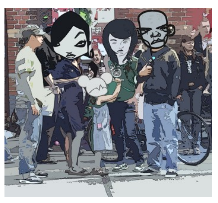
Illustration Amsterdam Netherlands