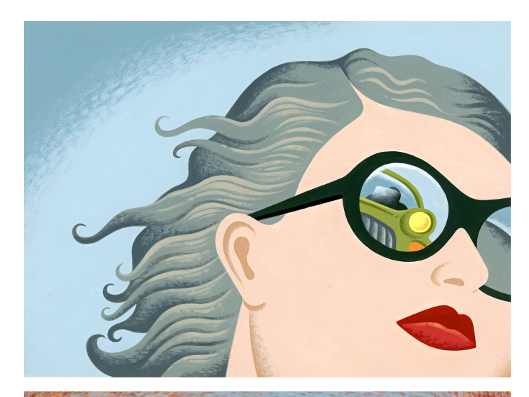
Illustration United States