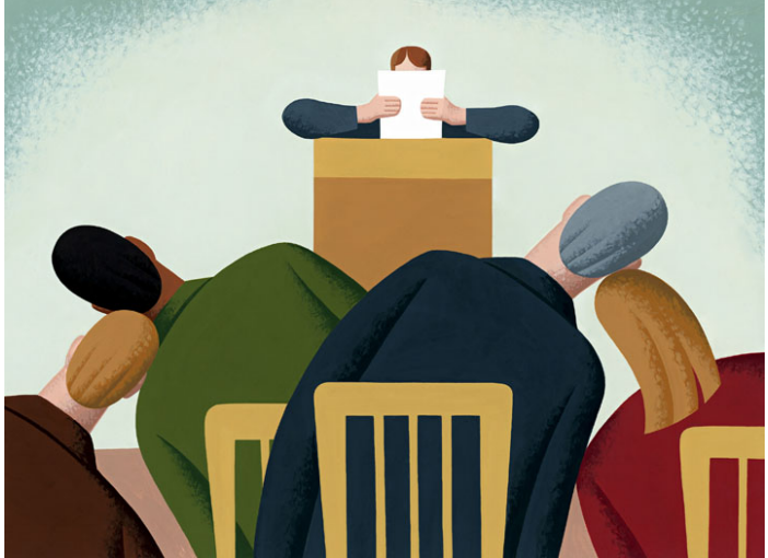
client: The Chronicle of Higher Education - Boring speech.