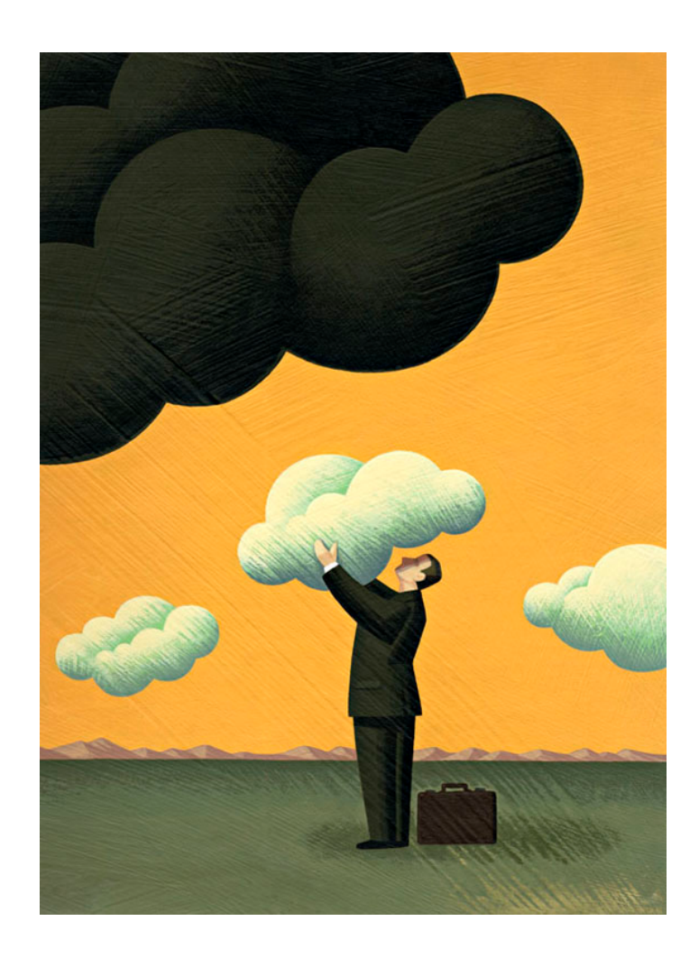
Illustration United States