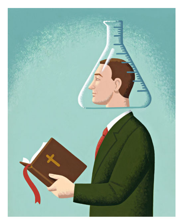
client: The Chronicle of Higher Education - faith vs science.

View the full portfolio at http://www.thecreativefinder.com/adamniklewicz