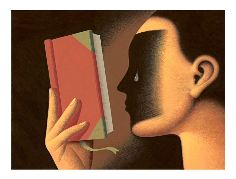
client: Psychotherapy Networker - reading is therapeutic.

View the full portfolio at http://www.thecreativefinder.com/adamniklewicz