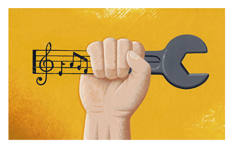
client: The Chronicle of Higher Education - Liberal and vocational education are part of the same story.

View the full portfolio at http://www.thecreativefinder.com/adamniklewicz