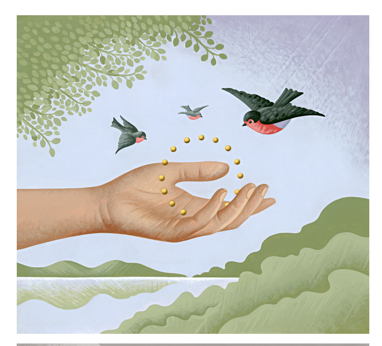
Illustration United States