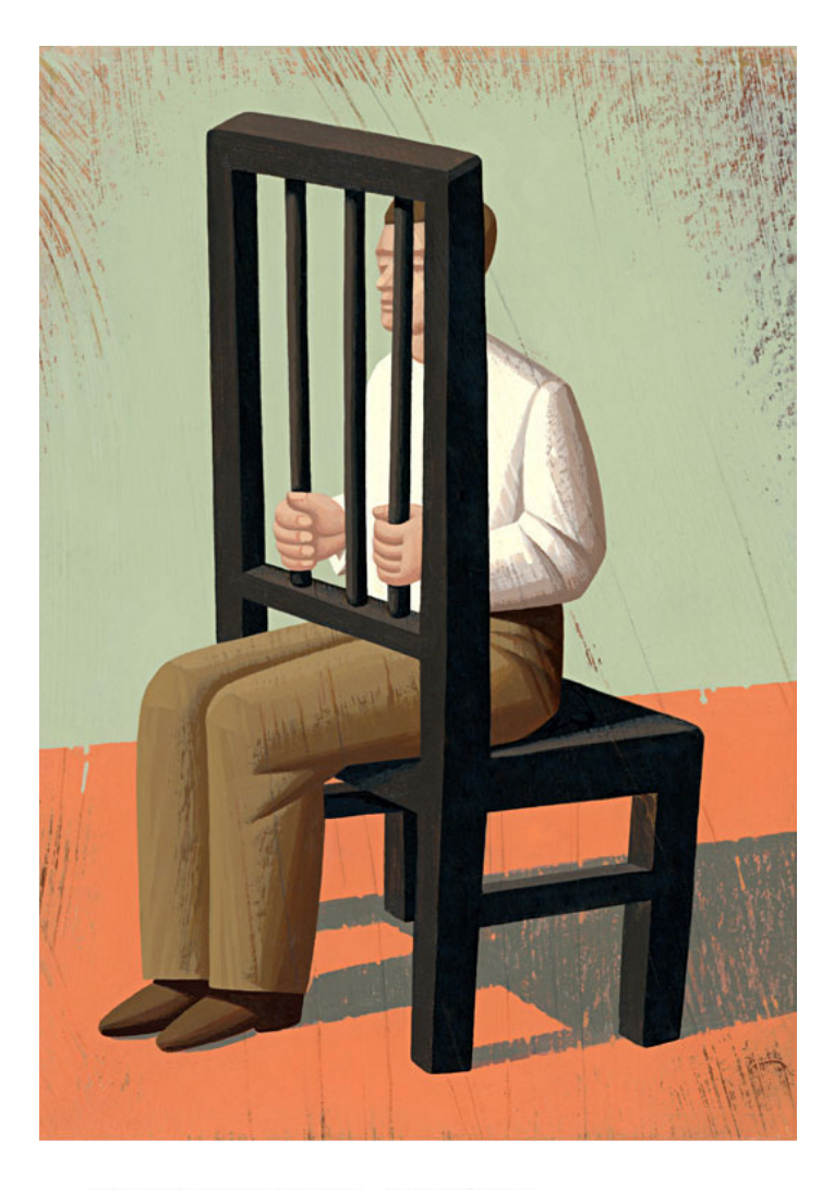
client: Psychotherapy Networker - mental disorder.

View the full portfolio at http://www.thecreativefinder.com/adamniklewicz