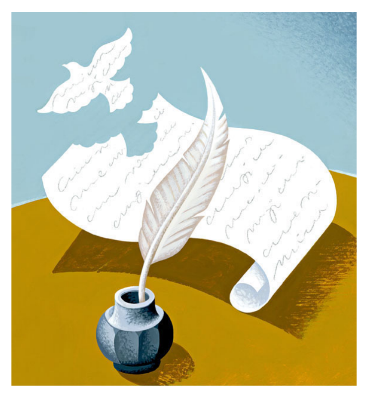
client: The Chronicle of Higher Education - Writing for real.