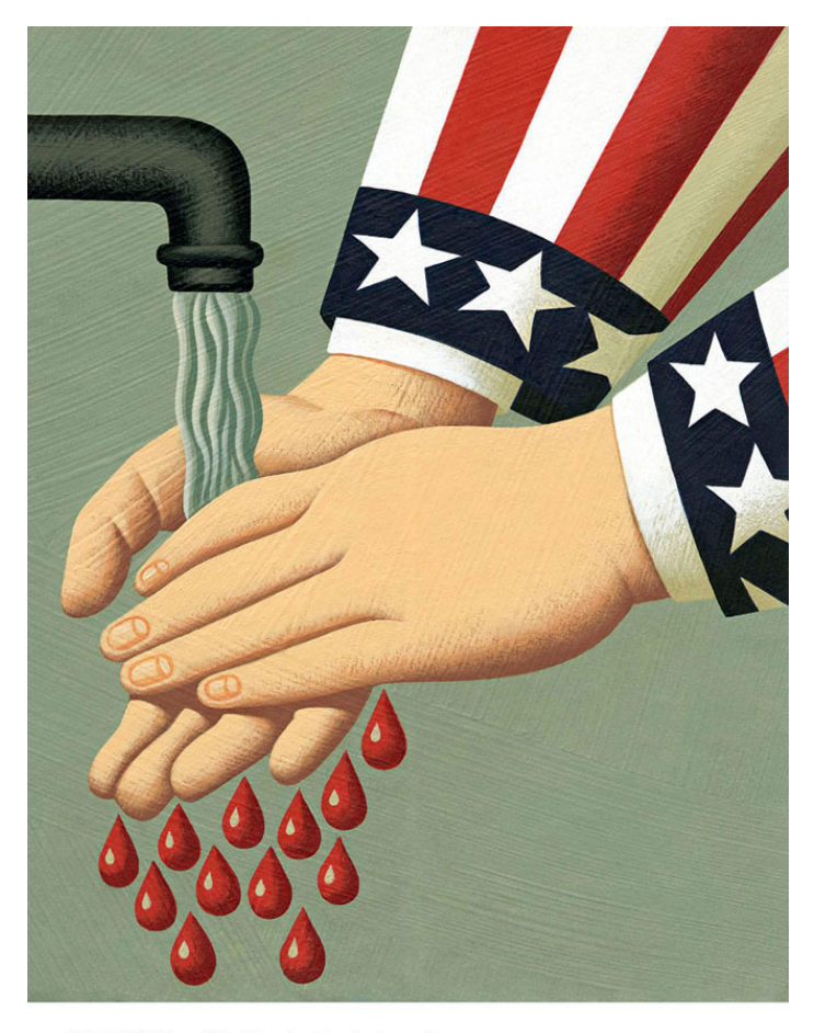
Wishful Thinking (client: Foreign Service Journal).

View the full portfolio at http://www.thecreativefinder.com/adamniklewicz