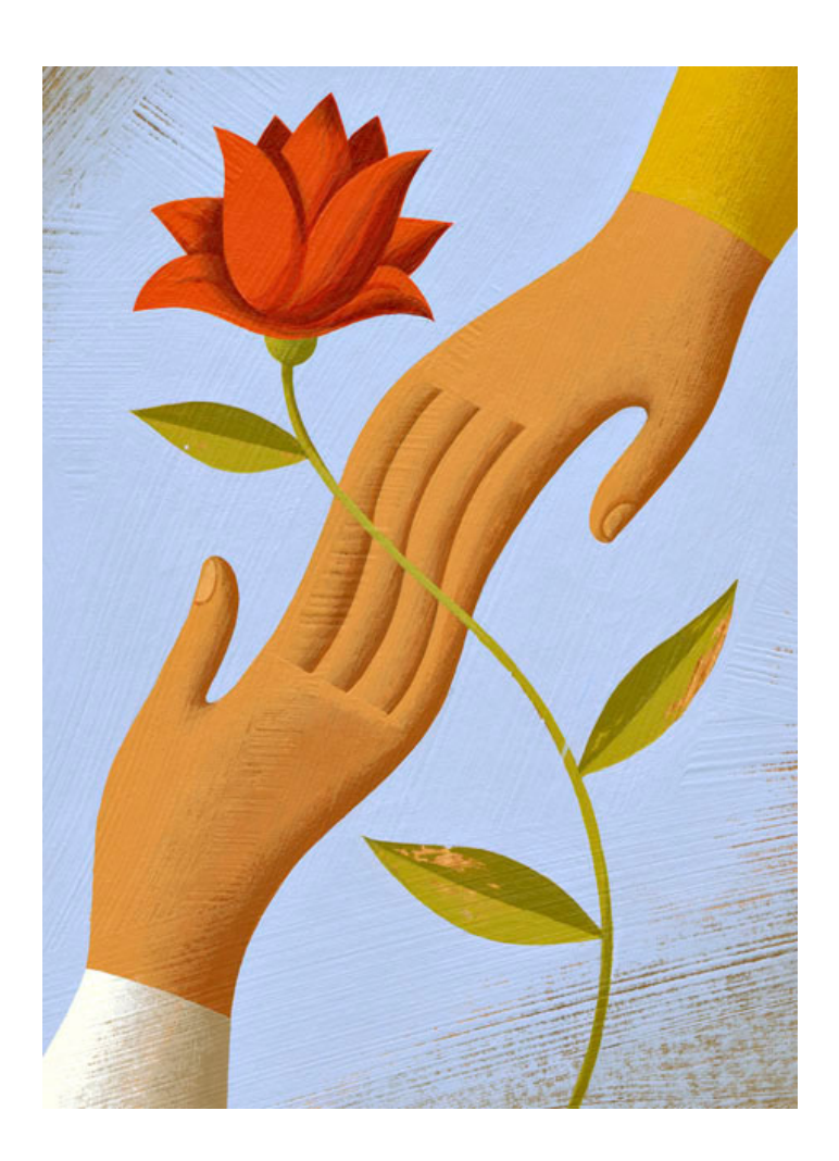
Illustration United States