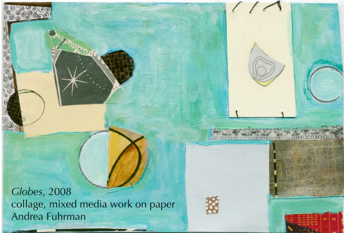
Globes, 2008 collage, mixed media work on paper Andrea Fuhrman

View the full portfolio at http://www.thecreativefinder.com/a_fuhrman