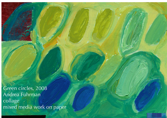
Green circles, 2008 Andrea Fuhrman collage mixed media work on paper