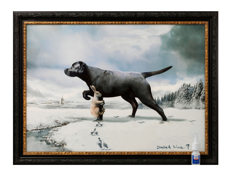
Illustration United Kingdom