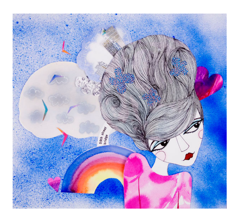
Illustration United Kingdom