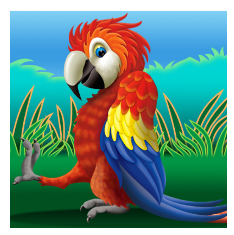
Illustration United States