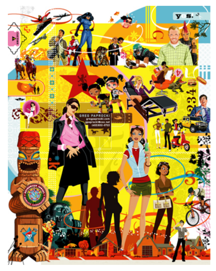
Illustration 2535 Country Club Ave. Omaha, NE 68104 USA United States