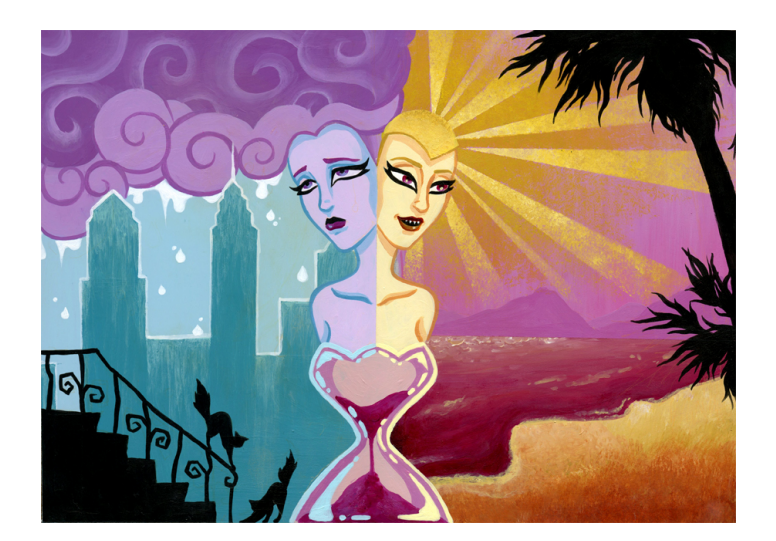
Illustration United States